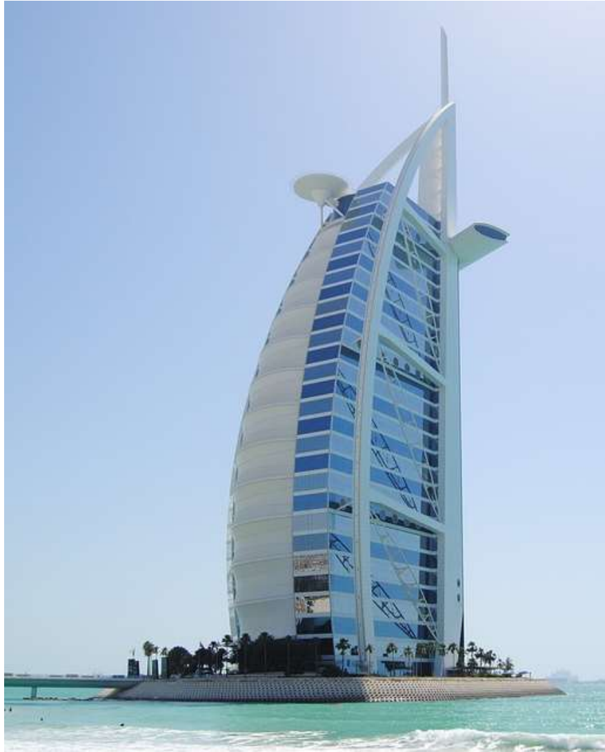
Dubai , Radler 1999, 2015, pixabay.com