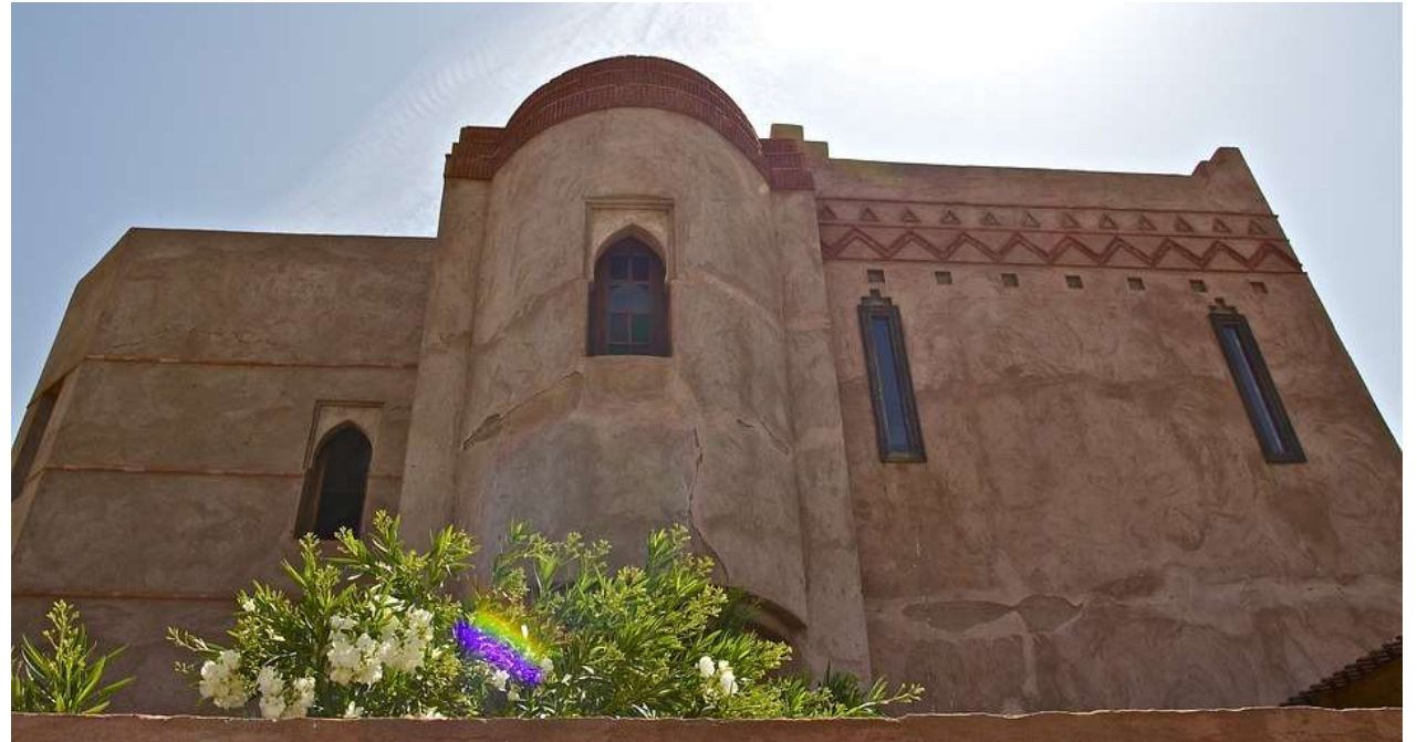
Morocco