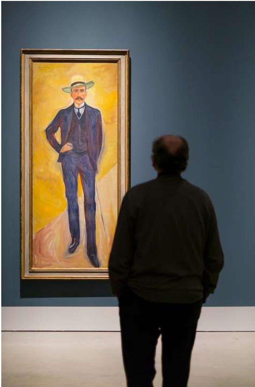
People , StockSnap, 2017, pixabay.com