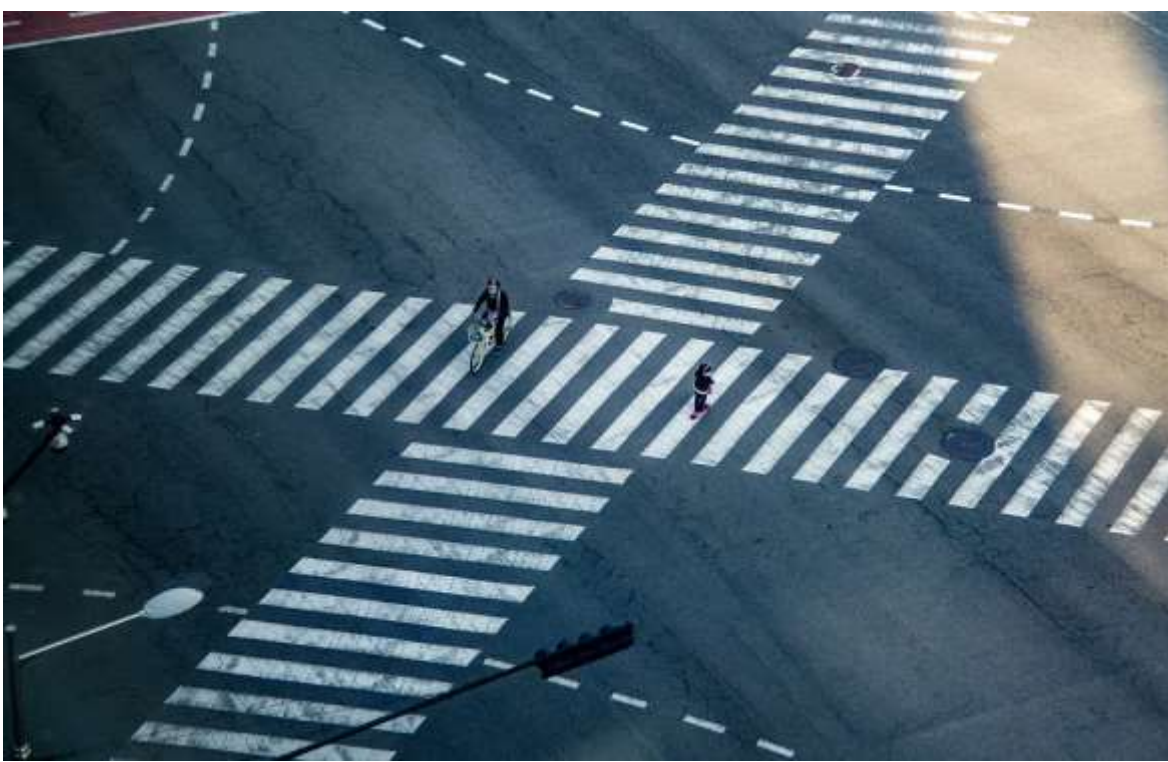
crosswalk