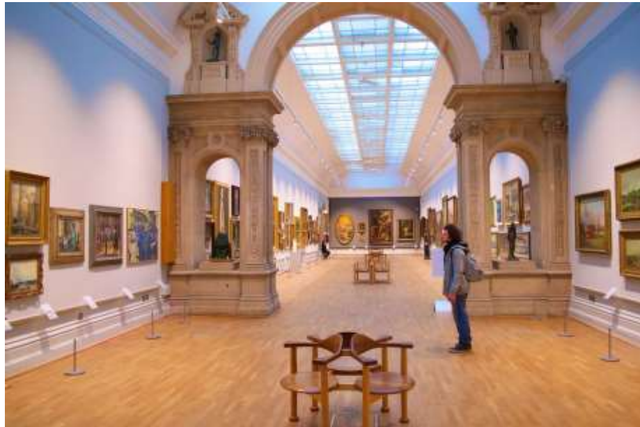
Louvre