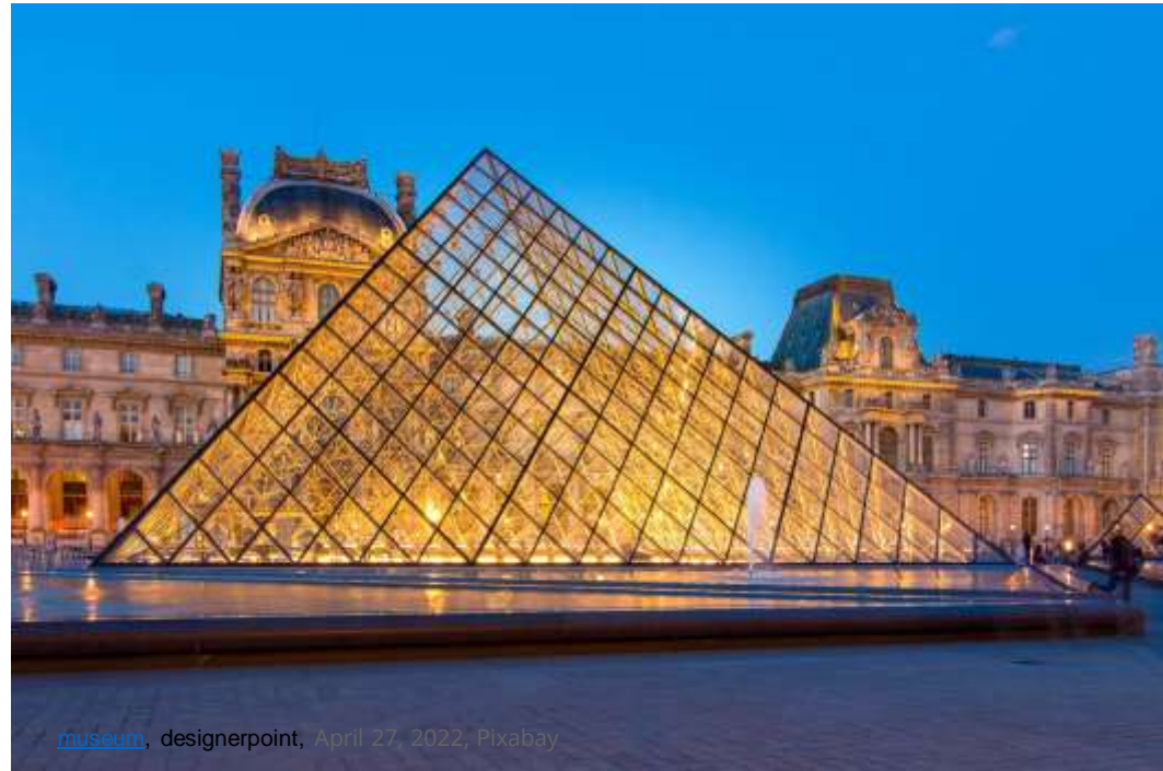
museum , designerpoint, April 27, 2022, Pixabay