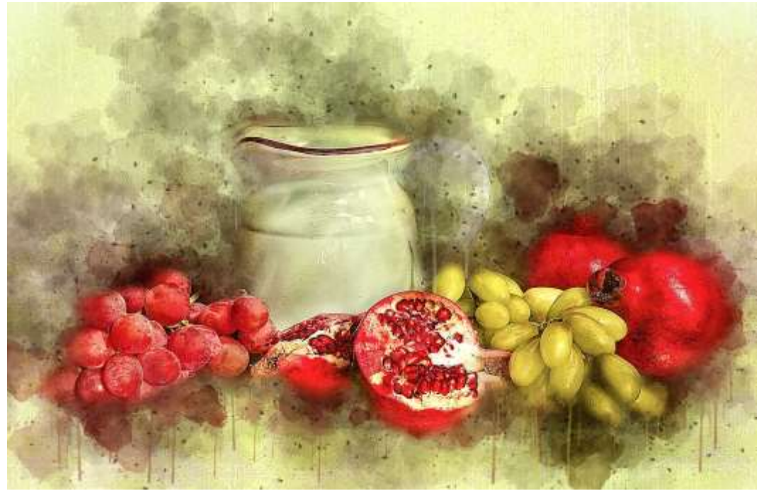
Still Life