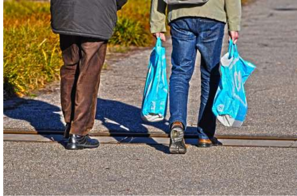
carry , MabelAmber 2018, pixabay.com